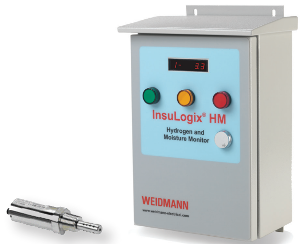
Optional moisture-in-oil sensor package